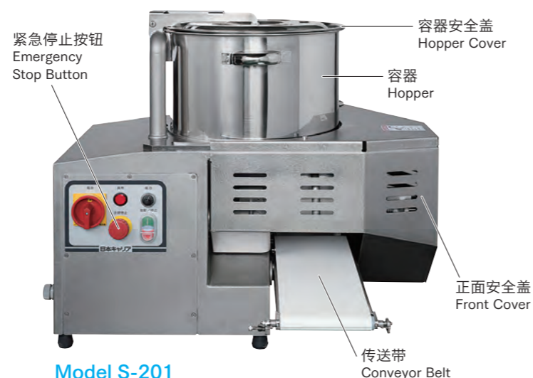
Model S-201 (台式) Model S-201 (table top model)