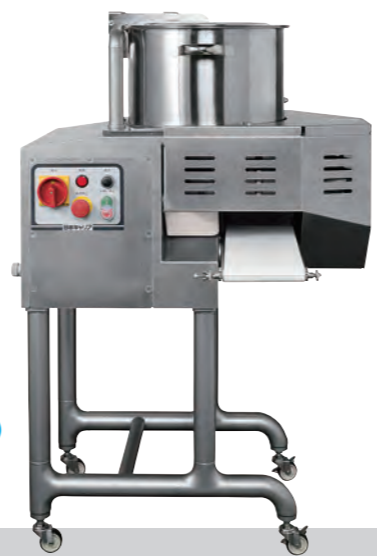
Model S-201H (立式) Model S-201H (Standing Type)

Can also be used to fill with pre-determined amounts